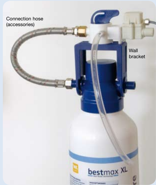
Connection hose (accessories)

Minimal water consumption during bleeding to ensure air-bubble free operation. Note: Filter cartridges from water+more by BWT require no activation! With bestflush and filter cartridges from water+more by BWT, you can reduce your water consumption to a minimum. You save time and money